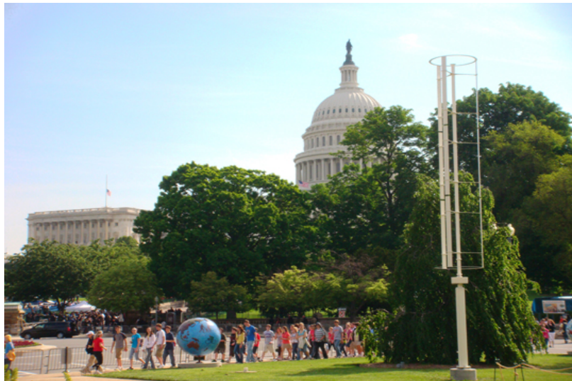
The Windspire® Wind Turbine on Display at the US Botanic Gardens

The Windspire as Art event on July 8 th is part of the 15 th annual Artown festival, July 2010. The month-long summer arts festival features more than 400 events produced by more than 100 cultural organizations and businesses in locations citywide, with major funding provided by the City of Reno.